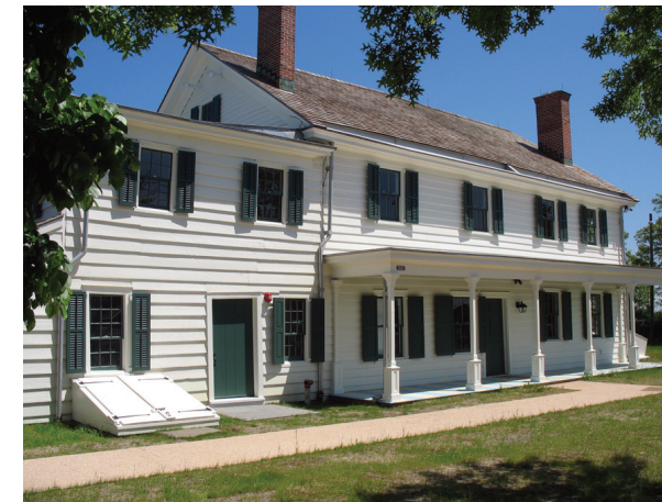
Bayshore Activity Center

Bayshore Waterfront Park was acquired by Monmouth County in 1988. In 1998 the Bayshore Activity Center was acquired from Middletown Township as a park addition. It is one of the oldest surviving houses in the Bayshore region with ties to the area's settlement, as well as maritime history. The oldest section of this large frame house dates back to the early 1700s, with multiple additions built by the Seabrook and Wilson families between the 1700s and 1800s. The waterfront setting of this valued community landmark gives way to views of the New York City skyline and Raritan/Sandy Hook Bay.