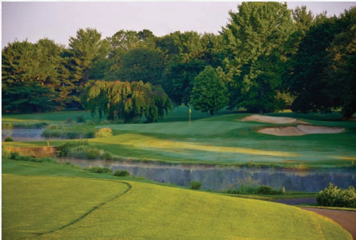
Hominy Hill Golf Course

I'm excited to announce the development of an outdoor concert venue at the East Freehold Showgrounds in summer of 2026, ParkStage. Monmouth County, in collaboration with Count Basie Center for the Arts, ParkStage will serve as a premier location for live entertainment, music, comedy, and more! This concert series is part of a greater effort to celebrate and commemorate America's 250th anniversary.