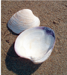
Hard Shell Clam ( Mercenaria mercenaria )