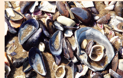
A collection of mussel shells, commonly found at Fisherman's Cove

Bayshore Waterfront Park, Port Monmouth is located along the shore of Sandy Hook Bay. Here you will find large numbers of slipper shells, clams and mussels. This is also the best spot for locating the State Seashell of New Jersey, the knobbed whelk.