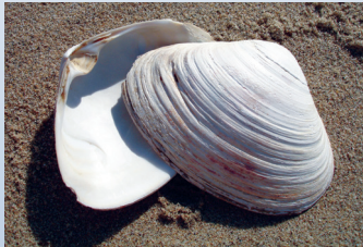
Surf Clam ( Spisula solidissima )