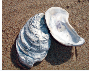
Oyster ( Crassostrea virginica )