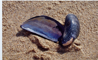
Blue Mussel ( Mytilus edulis )