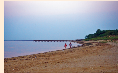
Bayshore Waterfront Park

The Monmouth County Park System has three locations to enjoy beach combing and seashell collecting. Each offers a different variety of shells to discover due to their different locations.