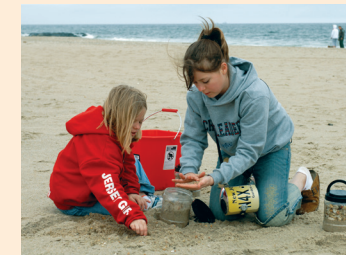
Seven Presidents Oceanfront Park

Fisherman's Cove, Manasquan is located on the Manasquan River just inside the Manasquan Inlet. Here you can find mussels, clams and oysters.