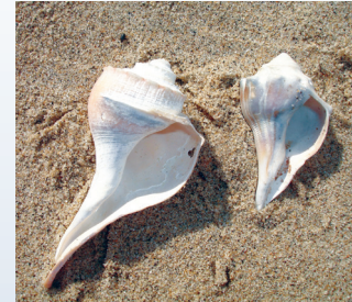
Channeled Whelk ( Busycon caniculatum ) Left

Shells of gastropod mollusks can also be found on New Jersey beaches. These animals have one shell and can be referred to as univalves, or more commonly as snails. Gastropod mollusks can close the opening of their shell with a thin shell-like covering called an operculum. The knobbed whelk was once so common it was chosen as New Jersey's state shell, but today it is a rare beach find.