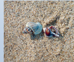
Oyster Drill ( Urosalpinx cinerea )