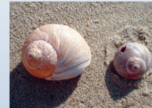
Moon Snail ( Lunatia heros )