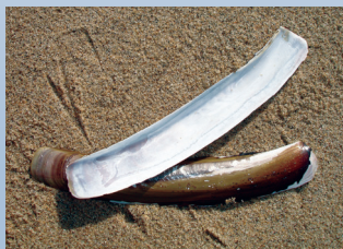
Common Razor Clam ( Ensis directus )