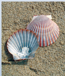
Bay Scallop ( Argopecten irradians )