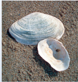
Soft Shell Clam ( Mya arenaria )