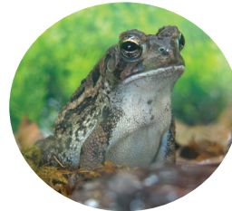
Fowler's Toad; note the squat, chubby body and warty, splotchy skin

Although frogs and toads are more familiar than salamanders, people still question how to tell them apart. They are very similar with many overlaps, and should be thought of as a continuum, ranging from aquatic to terrestrial. There are three broad groups.