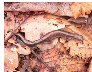
Redback Salamander in lead-back stage (without red stripe)