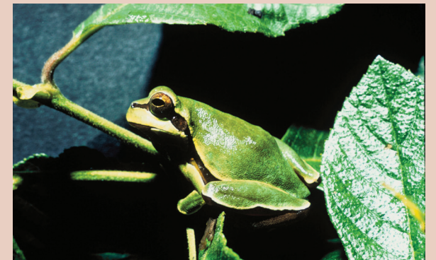
Pine Barren Tree Frog

example involving the Bullfrog. Historically, this large and dominant frog species was not found in the Pine Barrens region of NJ because of the highly acidic water. Due to pollution, the water became less acidic allowing Bullfrogs to move in and take over species native to that area: the Pine Barren Treefrog is now threatened and the Carpenter Frog is a species of special concern.