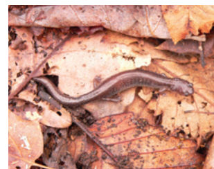
Redback Salamander in lead-back stage (without red stripe)