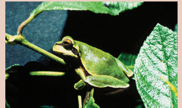
Pine Barren Tree Frog

example involving the Bullfrog. Historically, this large and dominant frog species was not found in the Pine Barrens region of NJ because of the highly acidic water. Due to pollution, the water became less acidic allowing Bullfrogs to move in and take over species native to that area: the Pine Barren Treefrog is now threatened and the Carpenter Frog is a species of special concern.