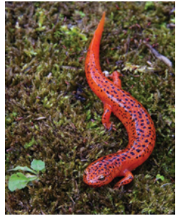
Northern Red, a lungless salamander

Salamanders are often confused with lizards because they share a similar body plan: four legs, a long body, and a long tail; but lizards are no more closely related to amphibians than to any other reptile. Throughout history, salamanders have been linked to myths, especially myths dealing with fire. This may stem from the fact that salamanders often hide in dead logs that may have been used for firewood. Upon lighting the log in a hearth, the sight of a creature emerging (fleeing, really) from the flames clearly would have seemed supernatural.