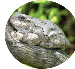
This Gray Tree Frog was perched in a tree near the front pond at the Manasquan Reservoir Environmental Center—a location that tells its type

Among True Frogs, these two can look very similar. Tell them apart by noting how far the dorsolateral ridge extends around the ear drum. For the Green Frog, it extends around the gland and down the back ; for the Bull Frog it is just around the ear drum.