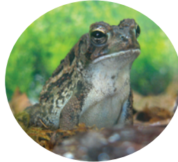
Fowler's Toad; note the squat, chubby body and warty, splotchy skin

Although frogs and toads are more familiar than salamanders, people still question how to tell them apart. They are very similar with many overlaps, and should be thought of as a continuum, ranging from aquatic to terrestrial. There are three broad groups.