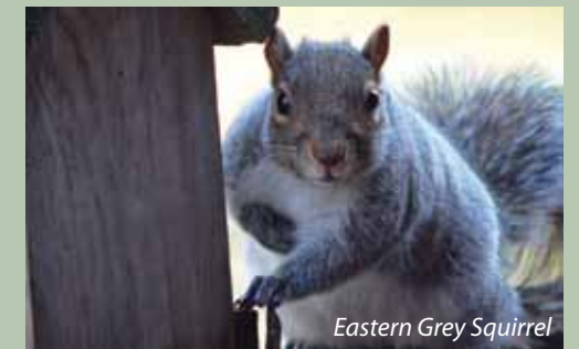
Eastern Grey Squirrel