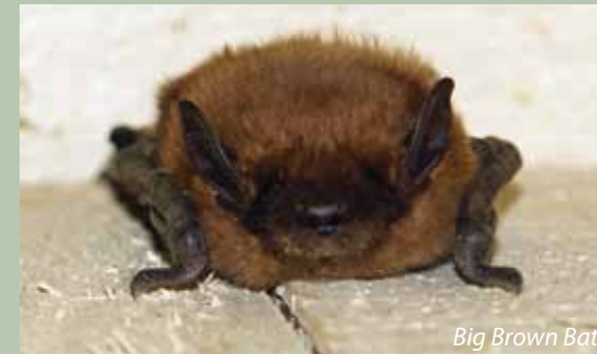
Big Brown Bat

There are mammals that fly, such as the nocturnal bat that feeds on mosquitoes, moths, beetles and wasps captured during flight; and hole-dwelling mammals that carry their babies in a kangaroo-like pouch (marsupials), such as the opossum.