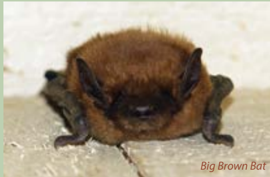
Big Brown Bat

There are mammals that fly, such as the nocturnal bat that feeds on mosquitoes, moths, beetles and wasps captured during flight; and hole-dwelling mammals that carry their babies in a kangaroo-like pouch (marsupials), such as the opossum.