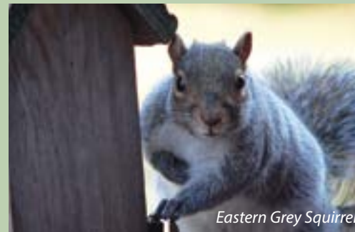
Eastern Grey Squirrel