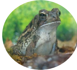
Fowler's Toad; note the squat, chubby body and warty, splotchy skin

Although frogs and toads are more familiar than salamanders, people still question how to tell them apart. They are very similar with many overlaps, and should be thought of as a continuum, ranging from aquatic to terrestrial. There are three broad groups.