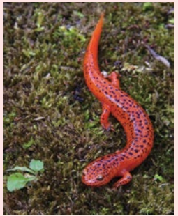
Northern Red, a lungless salamander

Salamanders are often confused with lizards because they share a similar body plan: four legs, a long body, and a long tail; but lizards are no more closely related to amphibians than to any other reptile. Throughout history, salamanders have been linked to myths, especially myths dealing with fire. This may stem from the fact that salamanders often hide in dead logs that may have been used for firewood. Upon lighting the log in a hearth, the sight of a creature emerging (fleeing, really) from the flames clearly would have seemed supernatural.