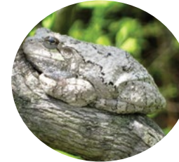
This Gray Tree Frog was perched in a tree near the front pond at the Manasquan Reservoir Environmental Center—a location that tells its type

Among True Frogs, these two can look very similar. Tell them apart by noting how far the dorsolateral ridge extends around the ear drum. For the Green Frog, it extends around the gland and down the back ; for the Bull Frog it is just around the ear drum.