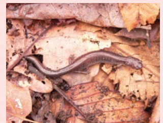
Redback Salamander in lead-back stage (without red stripe)