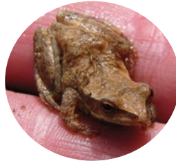
The tiny Spring Peeper sings a loud, high-pitched song in chorus on spring evenings.