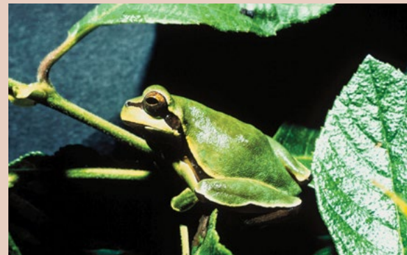
Pine Barren Tree Frog

example involving the Bullfrog. Historically, this large and dominant frog species was not found in the Pine Barrens region of NJ because of the highly acidic water. Due to pollution, the water became less acidic allowing Bullfrogs to move in and take over species native to that area: the Pine Barren Treefrog is now threatened and the Carpenter Frog is a species of special concern.