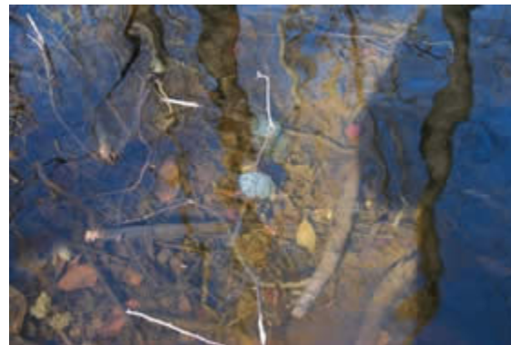
Wood Frog Eggs