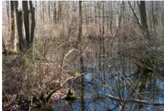
Full view of vernal pond

The following pictures are from a vernal pond near Bently Brook in Millstone: