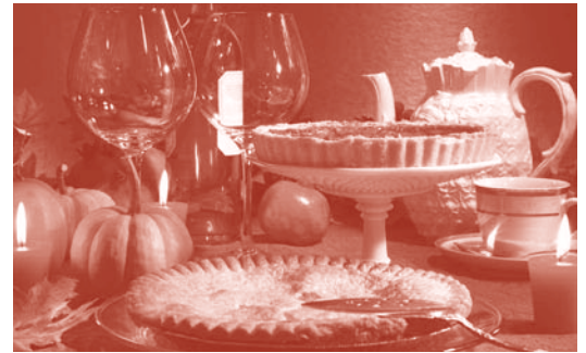
Bundle up and enjoy autumn! From the Staff at the Monmouth County Division on Aging, Disabilities and Veterans' Interment

When you protect yourself, you protect your loved ones as well. ❖