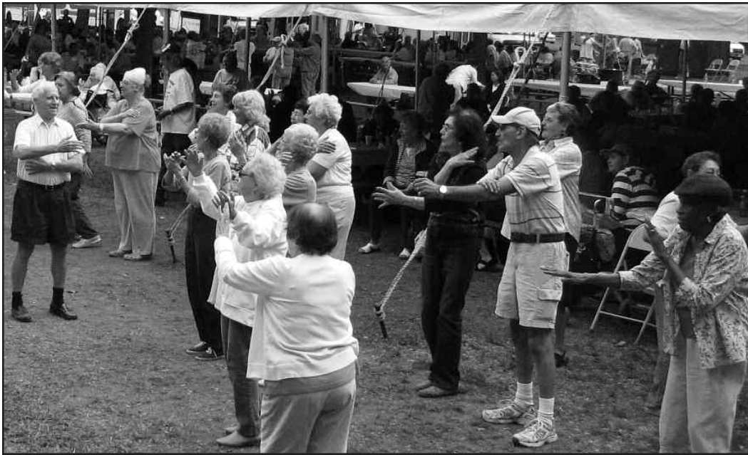
Senior Picnic guests enjoying the music and dancing at the Annual Senior Picnic in September.

It was a cloudy September day, but it didn't rain and the temperature was perfect for all to enjoy a day of fun, friendship and frivolity. Approximately 600 people attended the Office on Aging's Annual Senior Picnic. The event was held at East Freehold Park under tents set up especially for the occasion.