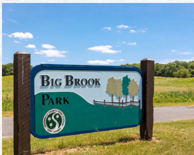
Big Brook Park